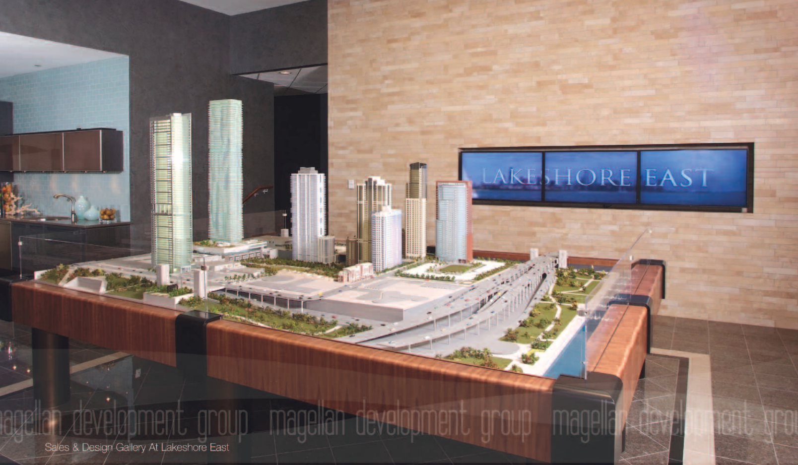
Sales & Design Gallery At Lakeshore East